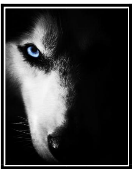
Best in Show 2013